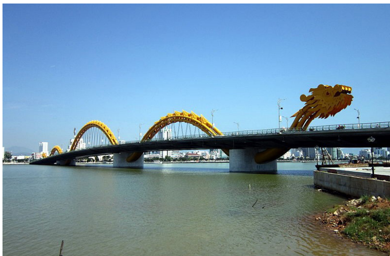
The Dragon Bridge in Vietnam uses arches that look like a dragon.

Span: The distance from one side of something to the other side, like the length of a bridge.